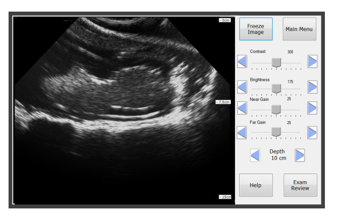
Figure 2: Scanning Screen with Help button (lower right)

Our prototype augments training programs by including a module called The Ultrasound Assistant which is accessible during every stage of an exam process via a large, visible help button that is of equal size to other important buttons (see Figure 2).