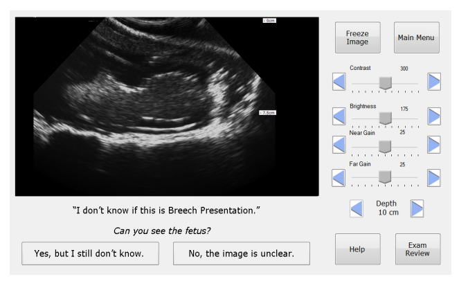
Figure 3: Decision Tree

Embedding expert guidance (scaffolding strategy 1) can help learners use and apply science content in remote settings, where there may not be a local ultrasound expert to assist them. To simulate expert guidance, we implemented a decision tree based on best practices in diagnostic ultrasound. The decision tree supports users who need more information about a particular topic, but may not know specifically what they are looking for. Some users will have broad questions with many answers (e.g. "Why can't I detect breech presentation?"). The decision tree helps users refine broad questions by asking them more specific questions and giving them hints about how to narrow down their focus to find questions with specific answers (see figure 3).