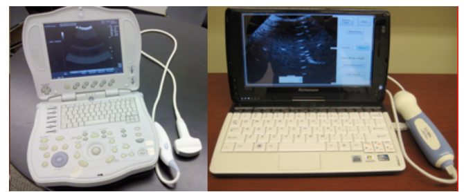
Figure 1: Comparison of GE LOGIQBook (left) and our simplified device (right)

machine and tracking a variety of outcomes, including whether or not mothers return to healthcare facilities for follow-up care. The GE LOGIQ Book XP, costing about USD20000, is a full-featured portable ultrasound machine designed for expert use. In previous work [2], we designed and built a device for developing world midwives that costs about USD3500 and has a much simpler user interface than commercial machines like the GE LOGIQ Book XP (see Figure 1). Cost savings result from a modular design approach; instead of designing an all-in-one system, we utilize an Interson USB probe attached to a netbook. Additionally, we have prototyped an integrated contextual help system for the device that, when deployed, will help supplement the limited sonography training received by most users. Our ongoing design process has been informed by needs assessment surveys completed by Ugandan midwives and field reports from members of our research team who have spent significant time in Uganda.