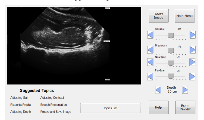
Figure 5: Suggested topics and all topics lists

Restricting complex tasks by setting useful boundaries for learners (scaffolding strategy 2) can provide effective scaffolding, provided those boundaries are flexible enough to adapt to a variety of learners. To provide useful boundaries without constraining our learners, we constructed two carefully curated topic lists which users can access in the top-level of the help system hierarchy. As shown in Figure 5, the primary list of suggested topics is populated with content that directly relates to the current exam stage (e.g. actively scanning, or taking measurements of a still image), while the secondary list allows the user to explore all topics within the system. Both lists are accessible within the top-level hierarchy in order to maintain flexibility, however, the suggested topics list is given visual primacy to provide our users with useful boundaries. If a user consistently selects a help topic at a given stage that is not immediately suggested, it will be added to the list of suggested topics for the next exam.