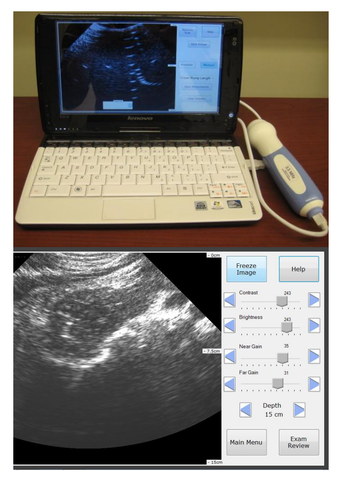
Figure 2. Prototype platform consisting of USB probe and netbook (above). Ultrasound scanning screen of the prototype simplified UI (below).

To maximize portability we chose the Lenovo IdeaPad S10-3t netbook (11.5" by 8.3" by 1.2" and weighing 3.2lbs) with a 10-hour extended battery, allowing several ultrasound exams to be performed when electricity is unavailable. The GE LOGIQ Book is also portable, but almost three times the weight of ours (9.2 lb) with less battery life (4-hours). In order to provide an image size that is diagnostically useful we chose a 10" touchscreen, balancing the opposing criteria of portability and ultrasound image size. Since one hand is already dedicated to holding the ultrasound probe, the other hand can make use of the touchscreen, touch pad, or mouse to optimize the image. A variety of commodity solutions are available for charging netbooks (e.g. car