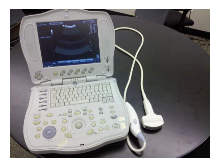
Figure 1. The pilot training program in Uganda is currently using GE LOGIQ Book ultrasound machines, which have a complex multi-purpose interface.

To better understand what functionality was either useful or difficult to use, we sent paper surveys with 14 questions to Ugandan midwives participating in the ECUREI ultrasound training program. All six of the midwives who responded stated that Time Gain Control (TGC), which allows the user to adjust the gain along many different bands, was the single most challenging feature to understand and use. Additionally, four out of six midwives reported that measuring fetal anatomical structures was also difficult. Other elements of the LOGIQ Book that midwives reported to be difficult were M-Mode imaging (for monitoring fetal heartbeat using a single ultrasonic beam), color Doppler (a method of imaging using the Doppler effect to show the direction